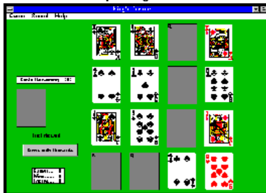
Above: End of Discard Mode