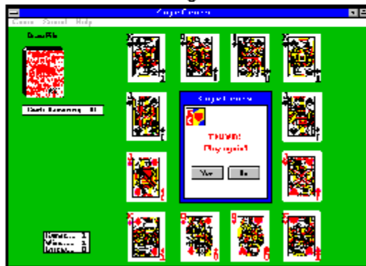
Above: A winning game